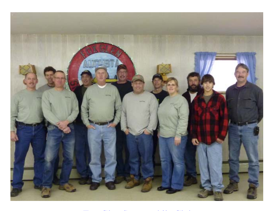
Fox Glen Snowmobile Club P.O. Box 4654 Augusta, ME 04330