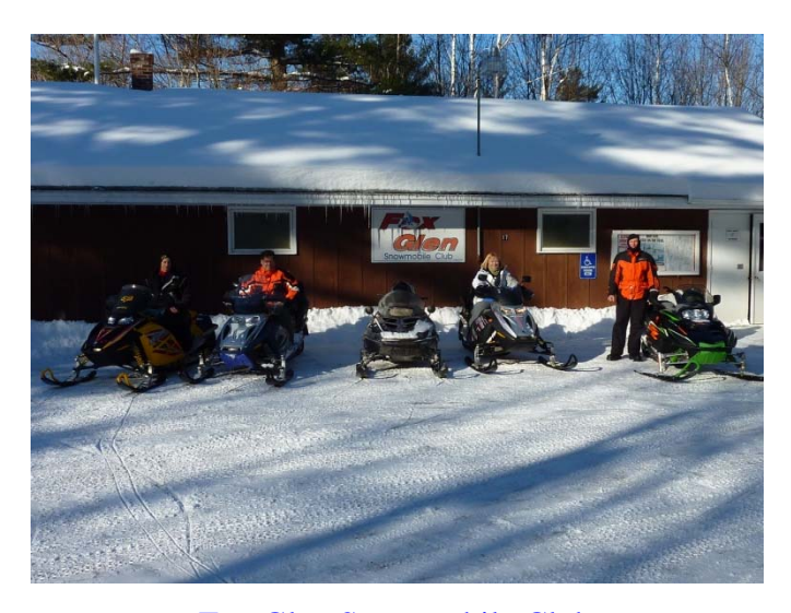
Fox Glen Snowmobile Club P.O. Box 4654 Augusta, ME 04330