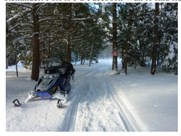
Fox Glen Snowmobile Club P.O. Box 4654 Augusta, ME 04330